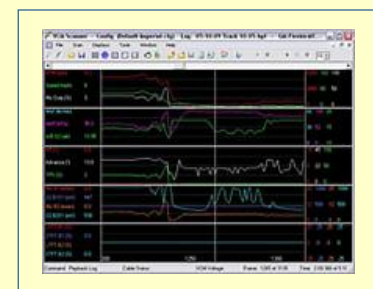
HP Tuners VCM Scanner Screenshot.