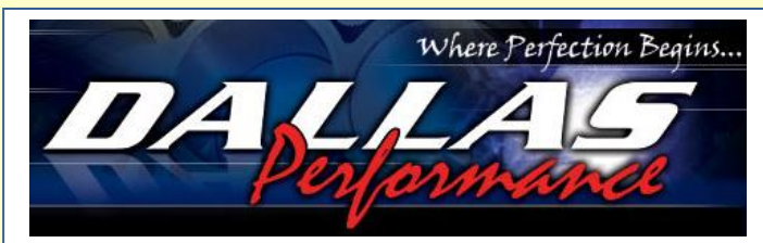
Dallas Performance Garland, Texas

Located at 3108 Benton Street in Garland, Texas, Dallas Performance has a state-of-the-art 2008 model Dynojet Chassis Dynamometer with Eddy Current. From V8 hybrid swaps to custom PCM tuning, Dallas Performance can handle all your "go fast" needs.