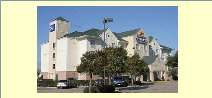
Holiday Inn Express Hotel & Suites Dallas, Texas

Located at 9089 Vantage Point Drive in Dallas, the Holiday Inn Express features a workout room, many business services with high speed internet available in the business services area and cable TV in every room.