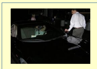
Tuning in a Camaro SS.