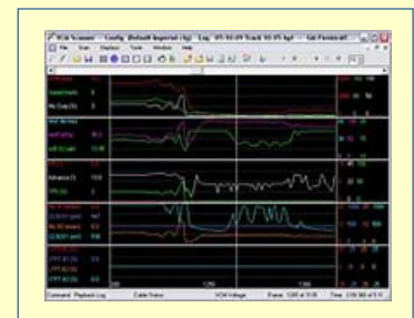
HP Tuners VCM Scanner Screenshot.